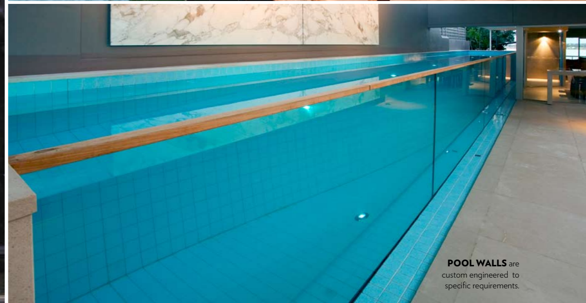
POOL WALLS are custom engineered to specific requirements.