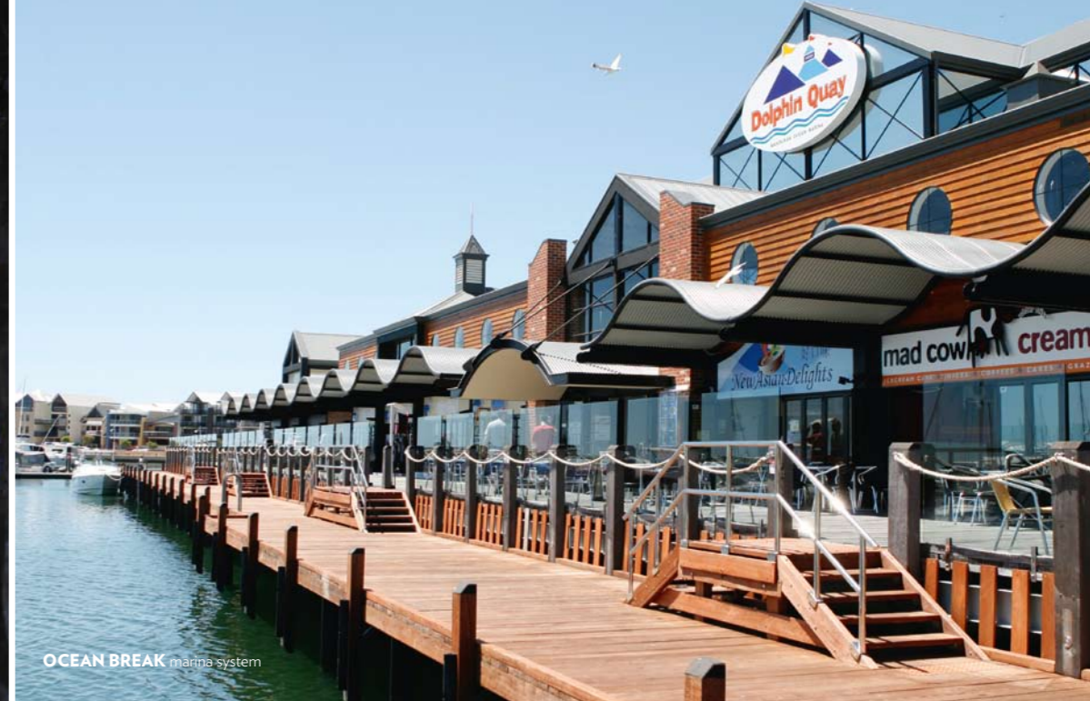
OCEAN BREAK marina system